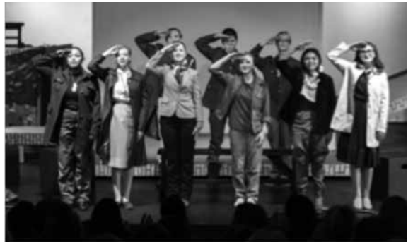
Piece of My Heart