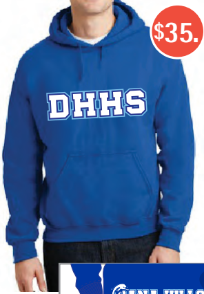
Royal Pullover Hoodie