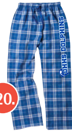
Plaid Flannel Pant

elastic waist and ankles imprint on side hip