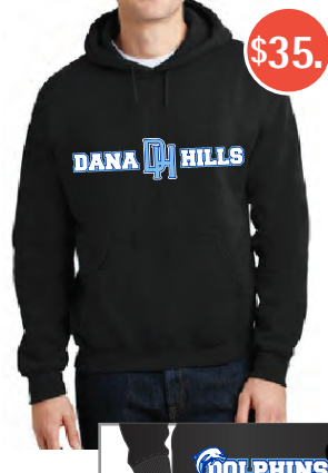
Black Pullover Hoodie

back printed front + back front pouch pocket